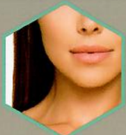
FACE / NECK